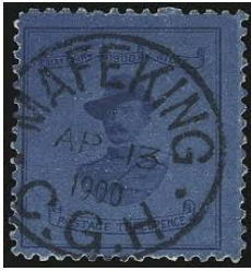
Postage stamp from Mafeking