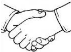
The Scout Handshake Is done with the left hand